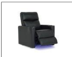
FEATURE IMAGE (shown) CONFIGURATION AK 5E LHF Power Recliner w/ RHF Wedg 7E RHF Wedge Arm Power Recliner 3E RHF Power Recliner